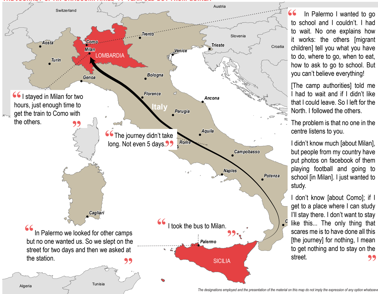
Map 2: Route taken from primary reception centre in Sicily to Como

The designations employed and the presentation of the material on this map do not imply the expression of any opinion whatsoever on the part of the Secretariat of the United Nations concerning the legal status of any country, territory, city or area or of its authorities, or concerning the delimitation of its frontiers or boundaries.